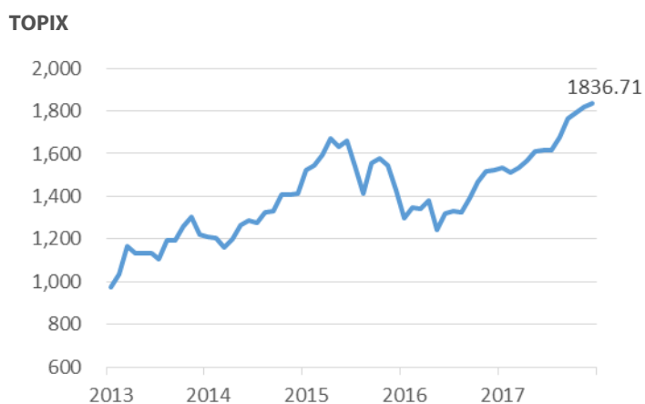
Exhibit 3: Major Market Indices