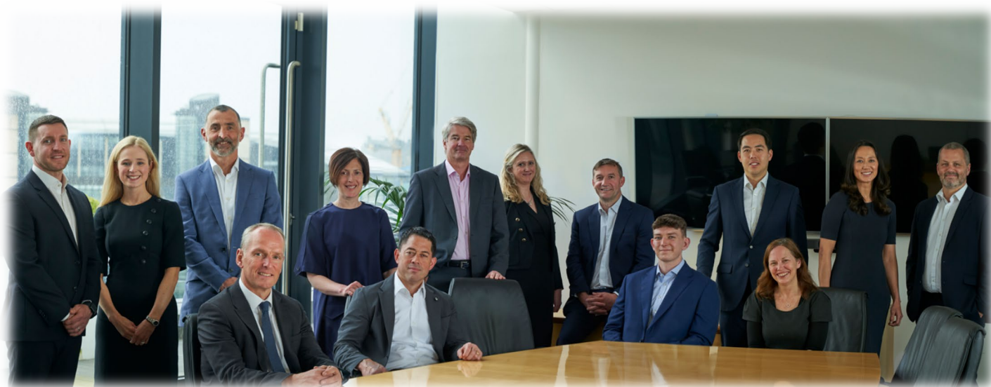
The Nikko AM Global Equity investment team