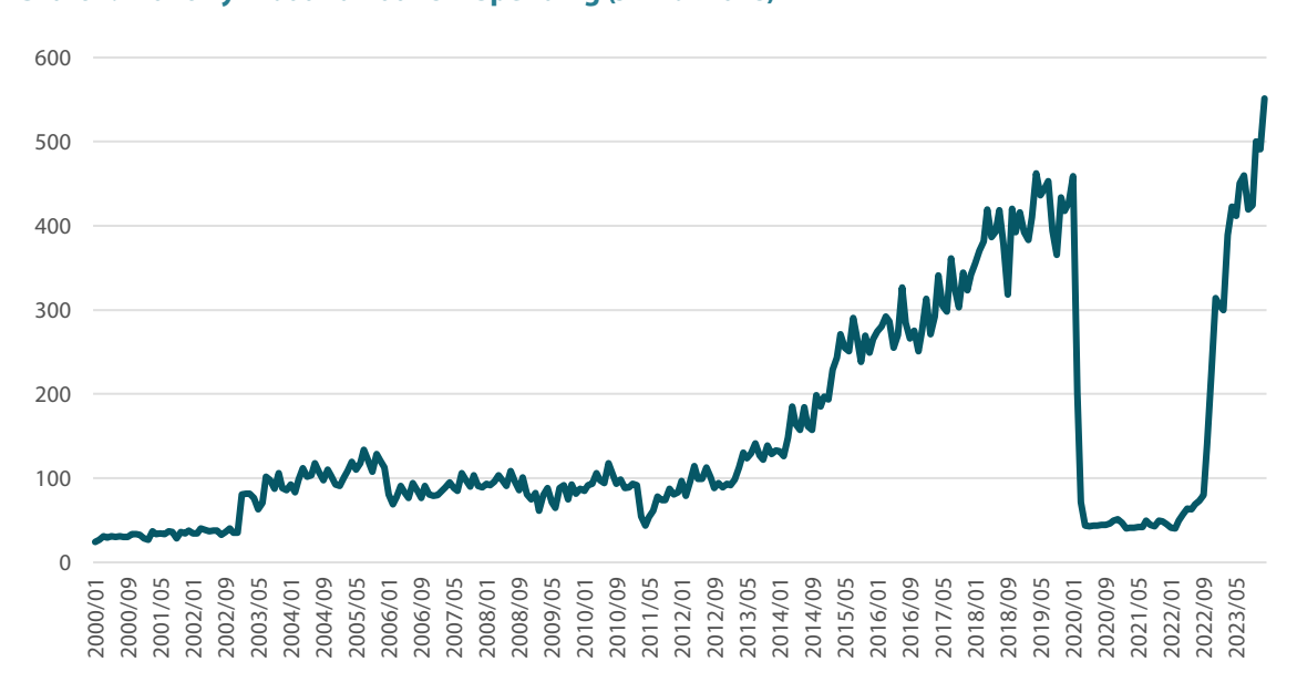
Chart 4: Monthly Inbound Tourism Spending (JPY billions)