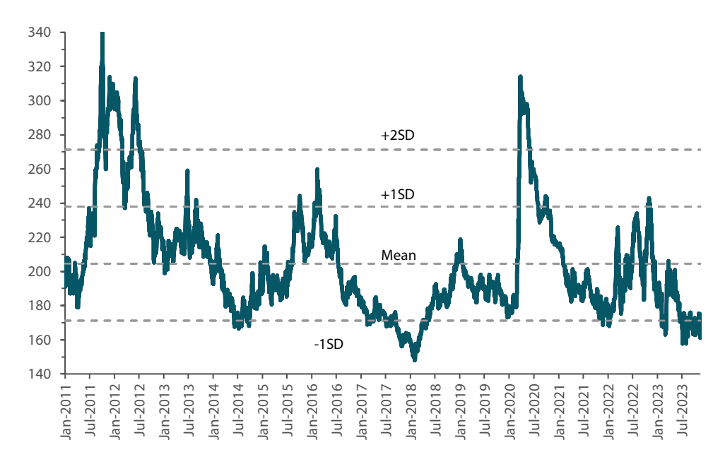
Chart 1: Asian high-grade spread

Asian HY spreads will increasingly be influenced, in our view, by developments in the Macau gaming space, India HY, Indonesia HY and unrated issuers across the Philippines and Hong Kong. Given the myriad cyclical and structural drivers for each of these sectors, it is difficult to call the direction for overall Asian HY spreads in 2024, although the current spread level remains wide and appears to offer room for compression over the medium term.