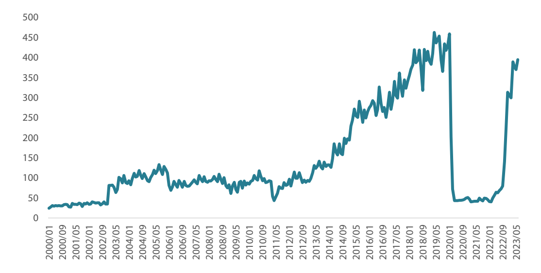
Chart 1: Monthly inbound tourism spending in Japan (JPY billions)

The return of Chinese tourists to Japan was the final restriction to be removed, and incoming tourism from the rest of the world has already returned to around 103.4% of pre-COVID levels, China's tourism to Japan has understandably been slower to recover and is still down at around 30% of pre-COVID numbers. However, Chinese tourism looks likely to improve throughout the second half of the year. What's interesting to note is that as a result of the Japanese yen weakness, tourism spending is outpacing tourist numbers, so even though tourist numbers haven't yet reached their 2019 levels, aggregate spending is quickly heading toward prior levels. This means we can expect a much faster recovery path than we had expected just three to six months ago. We are no longer talking about a recovery in tourism, but a further growth in inbound tourism from here.