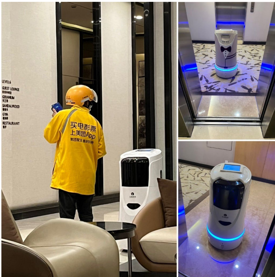
Exhibit 1: China's home delivery robots

In China, the COVID-19 pandemic has accelerated technological development, especially in the area of robotics and facial recognition. The usage of robots in everyday life in China has become the norm. For example, delivery staff would put the items to be delivered into a robot, which does the tail-end delivery within an apartment. When doing its errand, the robot can press the lift using Wi-Fi and ask fellow passengers to give way. Once at the customer's house unit or room, it will call the recipient via telephone for the pickup (Exhibit 1).