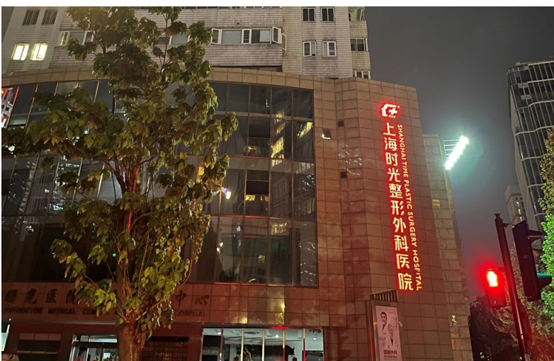
Exhibit 5: Demand for plastic surgery in China is on the rise

Plastic surgeries are also gaining popularity in China. Many people, especially females, under 35 years of age have had aesthetic surgeries, much to my surprise. An estimated 1.05 million people in China underwent plastic surgeries in 2020, according to a recent report by online statistics platform Statista, which is forecasting the annual growth of medical aesthetics market size in China to grow 17.5% on a year-on-year basis in 2023. This trend is giving rise to an increase in the number of specialised plastic surgery hospitals in China; there was one near our accommodation in Xintiandi, Shanghai (see Exhibit 5).