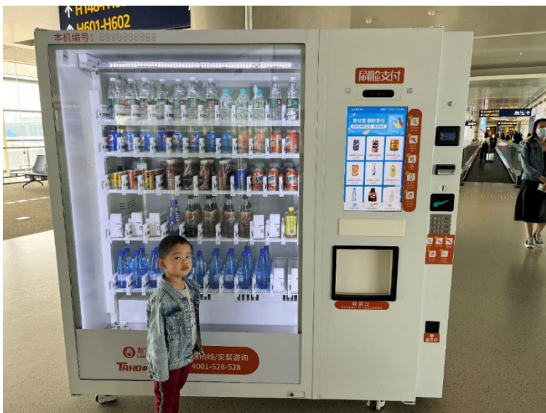
Exhibit 3: A vending machine that uses facial recognition for payment

Moreover, there are numerous high-tech vending machines across Chinese cities that use facial recognition technology, which allows a purchaser to pay for an item by scanning his or her face. For instance, to buy a drink from these new-generation vending machines (see Exhibit 3), one only needs to stand in front of the interface screen to initiate the facial recognition, which upon a successful transaction will drop the chosen drink into the dispensing outlet. This is done without the need for cash or the use of any payment app on a smartphone.