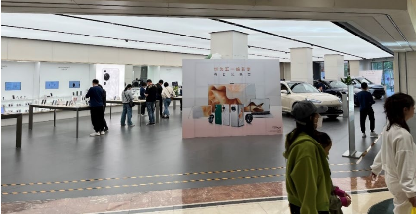
Exhibit 4: A showroom featuring smart car solutions

electronic control systems and interactive voice control (see Exhibit 4). A key observation is that many tech products, solutions and systems in China are manufactured by home-grown companies. This bodes well for the country's ambition to be self-reliant in science and technology amid intense technological competition with the US, which has barred US firms—including major chipmakers—from supplying semiconductor chips and artificial intelligence technology to Chinese companies.