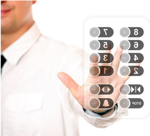
Exhibit 2: An image of a lift with hologram buttons

There are other intriguing technological innovations in China that are now commercialised thanks to the pandemic. When we were transiting in Hefei (a new tier-1 city), the lifts in the airport had hologram buttons, which enable users to key in their destined floor number using holographic images. Such hologram buttons prevented lift passengers from touching potentially contaminated surfaces during the pandemic. According to Chinese state media and a Hong Kong-based newspaper , a Hefei hospital similarly uses hologram buttons (see Exhibit 2) for its touchless registration and payment machines, all thanks to the holographic imaging technology developed by Anhui Easpeed Technology, a Chinese high-tech company.