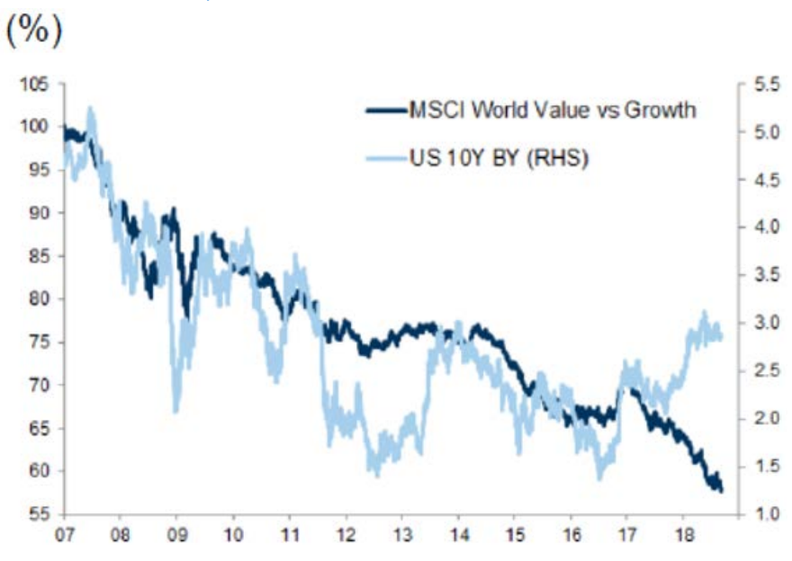
Chart 1 MSCI World Value vs Growth, US bond yields